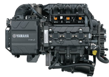
TR-1 HIGH OUTPUT ENGINE